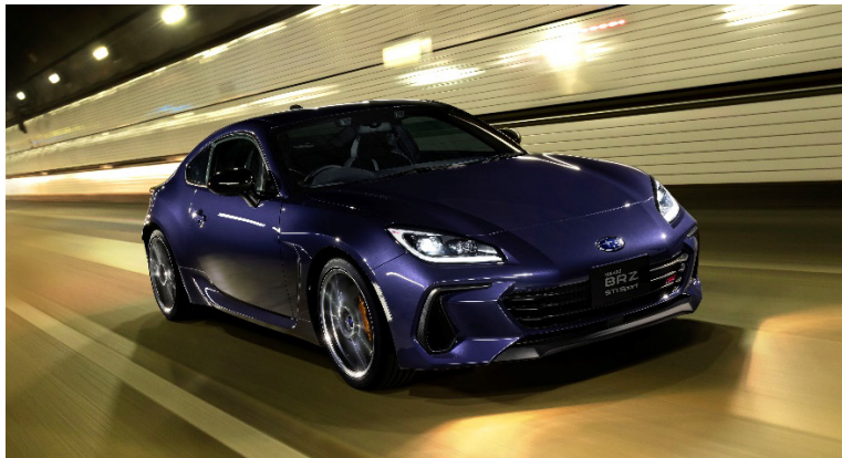
Subaru BRZ STI Sport PURPLE EDITION

Tokyo, December 20, 2024 – Subaru Corporation and its motorsport subsidiary Subaru Tecnica International (STI) *1 will exhibit at Tokyo Auto Salon 2025 to be held January 10 to 12, 2025 at Makuhari Messe in Chiba, Japan.