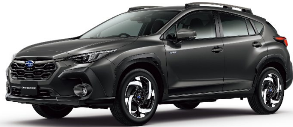
Subaru Crosstrek equipped with next-generation hybrid system (Japan model, prototype)

This newly developed hybrid system is designed to achieve a superior balance between driving enjoyment and environmental performance.