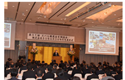
“General Cooperation Meeting” for the Automotive Business suppliers

In an effort to share with suppliers our mid- to long-term management strategies and our quality, procurement, production and sales policies, Subaru has been hosting “Policy Briefings” every spring, and have had 700 people from 400 companies participating in the Briefings. Subaru also periodically exchanges information by participating in “Cooperation Meetings” comprised of our suppliers. Once a year, Subaru awards those that have particularly contributed to R&D, production, and quality improvement.