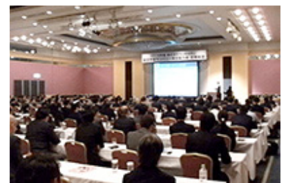
Presentation of quality improvement initiatives at Aerospace Company suppliers’ “Cooperation Meeting”