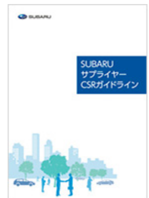
SUBARU Supplier CSR Guidelines